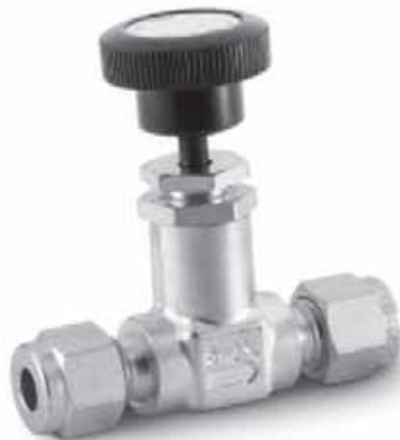
JN Series Valve